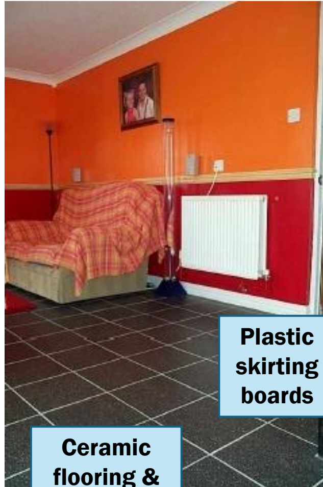
Plastic skirting boards