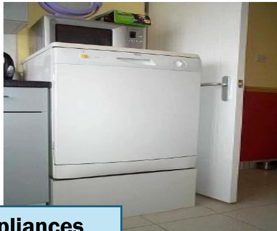
Main appliances raised up on plinths