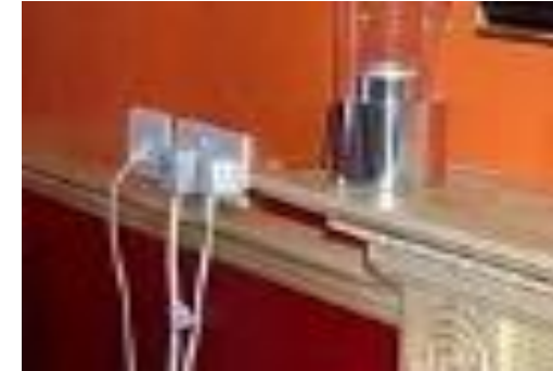
Electrical sockets raised above dado rail