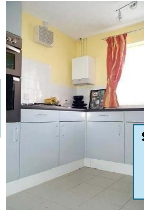
Steel kitchen units, with base units raised off the ground