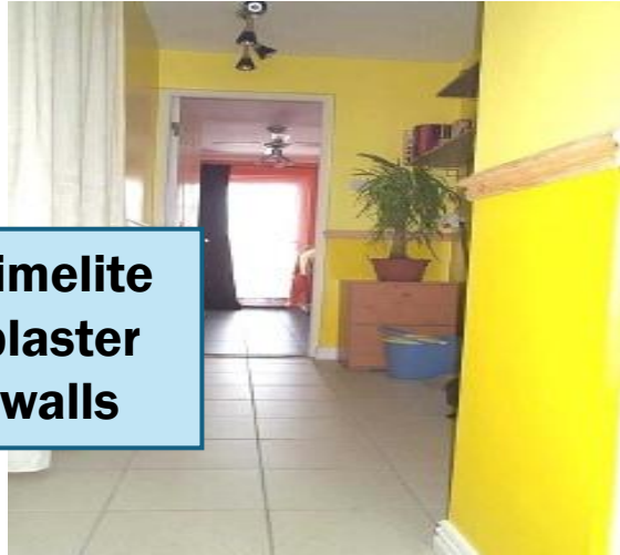
Limelite plaster walls

If your property is in a known flood risk area, or is already prone to flooding, there are steps you can take to mitigate the damage and make the clean up afterwards quicker and easier